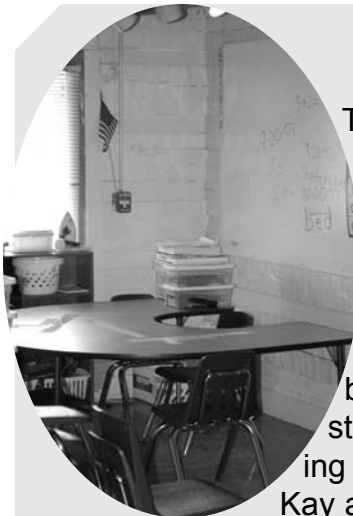
One of the primary classrooms

The Log Cabin has undergone some major renovations in order to make it more functional for our students. A wall was put up in one of the spaces, making two small classrooms for our primary students. The main room in the cabin is used by the primary students for morning meeting and other group gatherings, as well as for music classes.