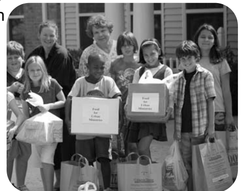
Fourth grade students collecting food for Urban Ministry

The first through fifth grade students attend Enhancement as their last class of the day. Students are split into four groups that rotate through library, keyboarding, dance, and guidance/study skills. This year's Enhancement curriculum incorporates the new and exciting element of community service. Once per week, students will be involved in a service project that will improve the lives of people in our immediate or worldwide community while teaching the students the importance of helping others. Already this year, students have picked up mulch at the playground, made bookmarks for a local nursing home, and collected food for Greensboro Urban Ministries. Other projects on the agenda will benefit our troops overseas and Hospice of Greensboro. The students and teachers are excited about having room in the school day to participate in community service.