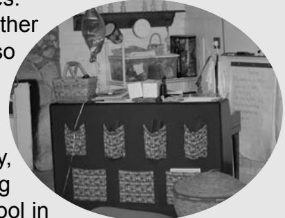
The music classroom

order to provide the most instructional benefits.